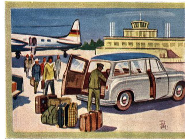
The P 70 Estate Car features extra reliability guaranteeing dead-on-time punctuality on all occasions.